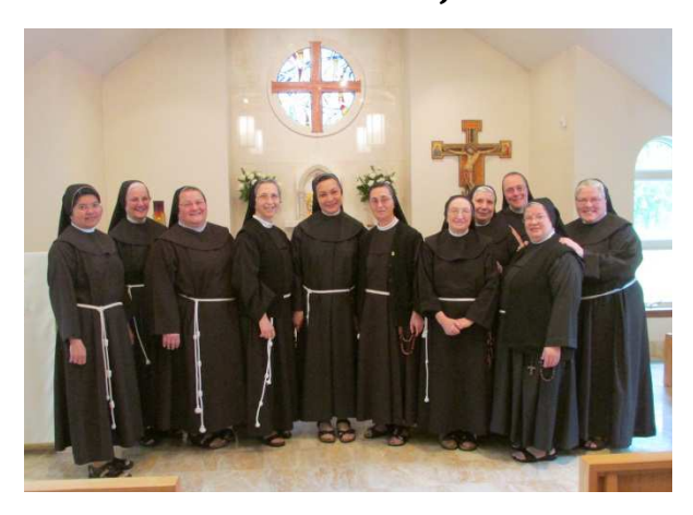
"COME FOLLOW ME..."

Have you experienced a persistent attraction, a tug...to live for Jesus, to follow Him more closely, to give of yourself generously to His mission of Salvation? Jesus may be calling YOU!